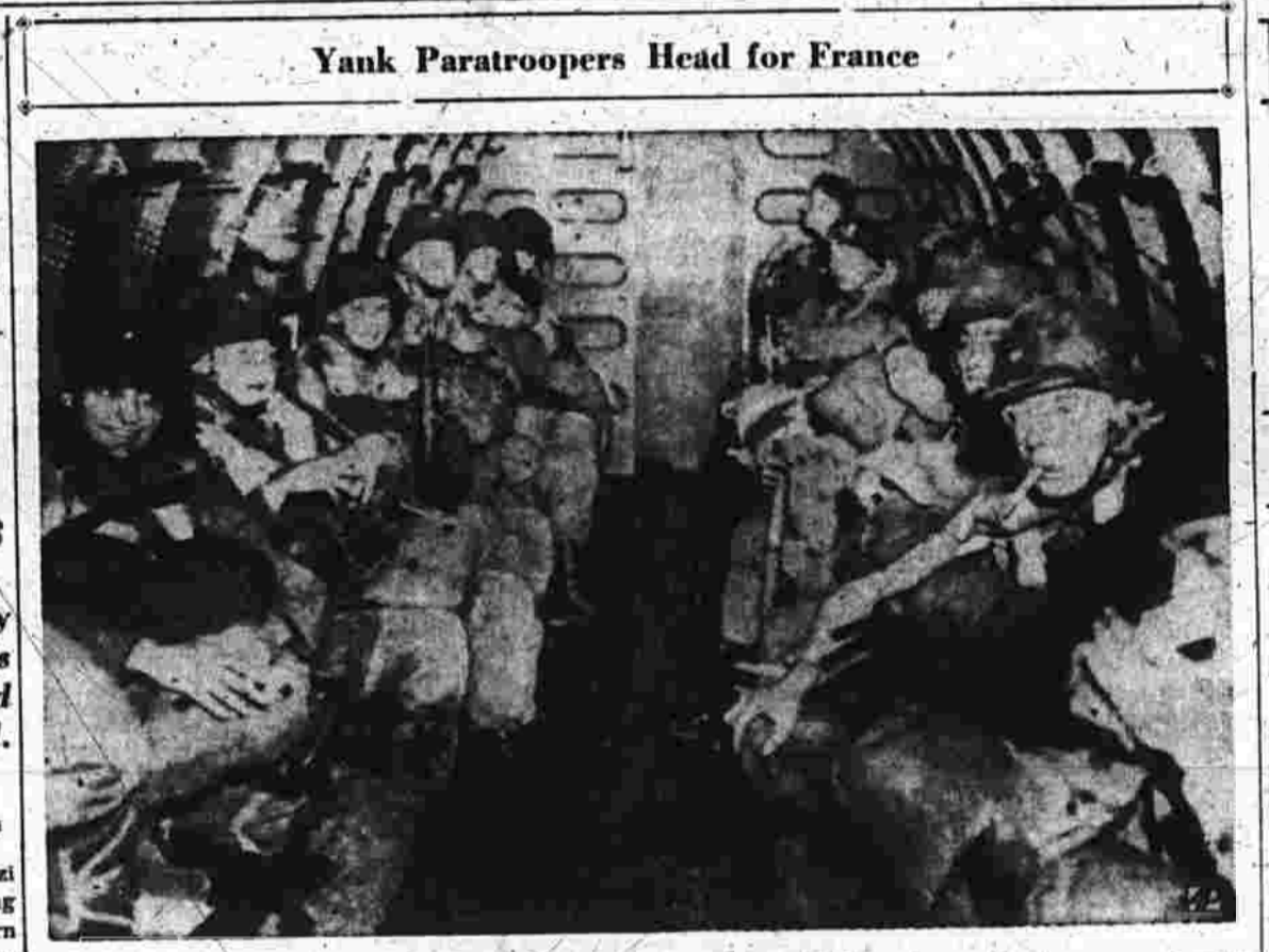
Yank Paratroopers Head for France

Allied planes of all descriptions (Continued on Page Eight)